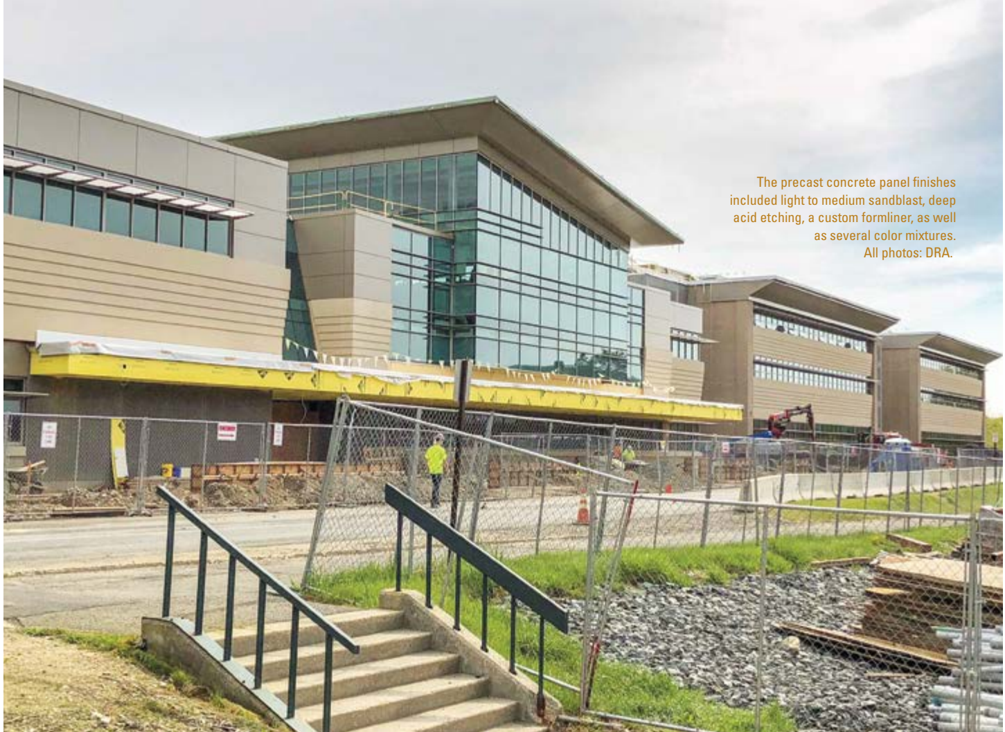
The precast concrete panel finishes included light to medium sandblast, deep acid etching, a custom formliner, as well as several color mixtures.