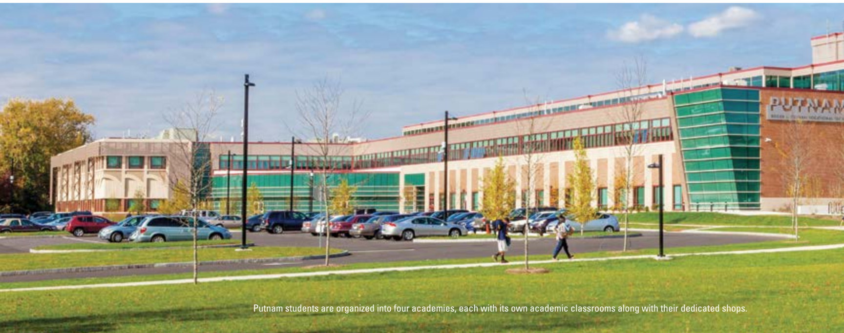
Putnam students are organized into four academies, each with its own academic classrooms along with their dedicated shops.