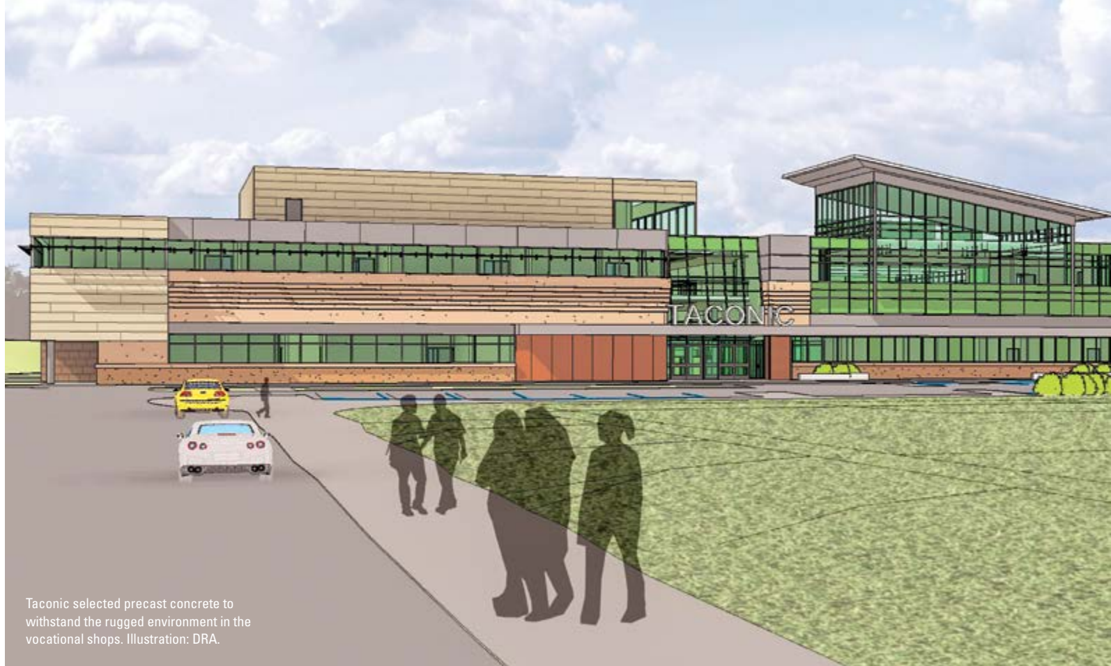
Taconic selected precast concrete to withstand the rugged environment in the vocational shops. Illustration: DRA.

the ground floor. The entrance to the building is situated close to the current visitor's parking lot and the main feature will be large glass windows to allow more natural light.