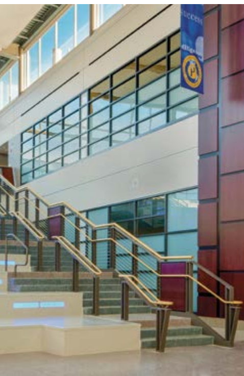
One of the goals of the new design was to improve indoor air quality and bring in more natural light.

right answer in all cases. DRA Architects strives to find balance between various systems in each project.”