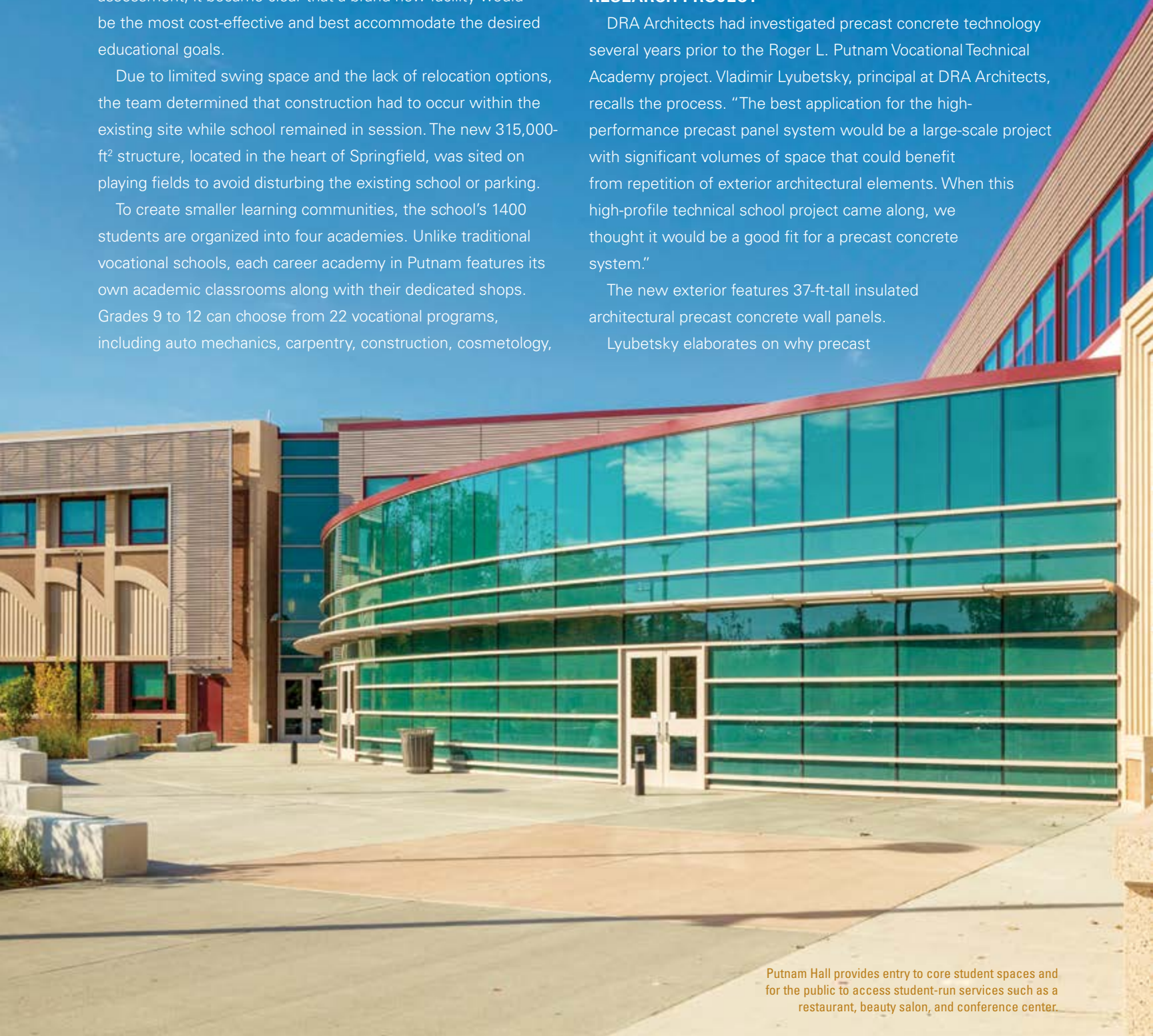
Putnam Hall provides entry to core student spaces and for the public to access student-run services such as a restaurant, beauty salon, and conference center.