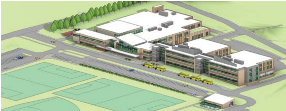
The new building is three-stories, with the academic classrooms on the top two floors and the vocational shops on the ground floor. Illustration: DRA.

multiuse venue will be used for a variety of activities such as performances, plays, concerts, and assemblies. The state-of-the-art auditorium will also double as a community space, with public access via a central lobby. Pittsfield Public School district hopes Taconic will be used over the summer and in the evenings as an educational space for the entire community.